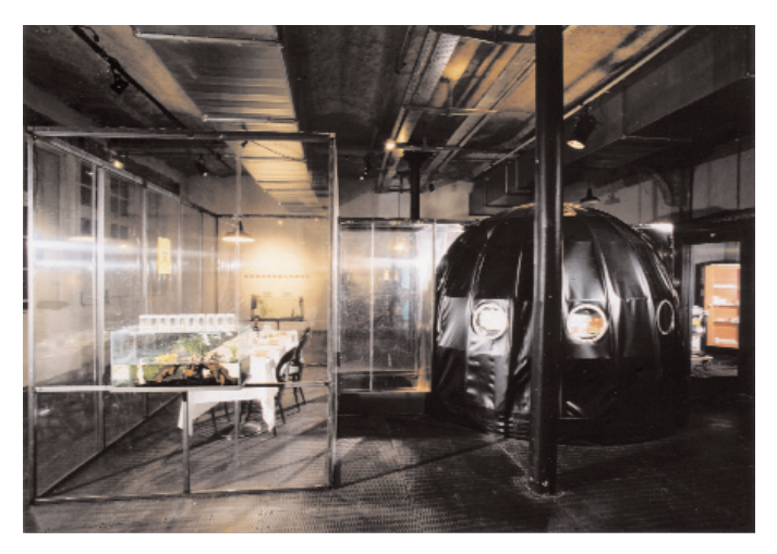
Figure 1. The Tissue Culture & Art Project, Disembodied Cuisine installation, Nantes, France, 2003.

As part of the TC&A project, we explore the ironies involved in the promise of a Victimless Utopia. In our Victimless Utopia series, we have explored the creation / construction of victimless meat in a project titled Disembodied Cuisine. [17] We ate, together with some brave volunteers, tiny semi-living frog steaks that were grown for more than two months in bioreactors and used not only expensive resources but also animalderived ingredients in the nutrient media. [Fig. 1] We referred to them ironically as extreme Nouvelle Cuisine in the sense that they were luxury goods (and not necessarily tasteful ones). Still, the irony sometimes seems to be lost too easily, and now the discourse about a victimless society is being used by a university spin-off company that attempts to secure funding for tissue-engineered meat as a possibility for eating meat without killing the animal. [18]