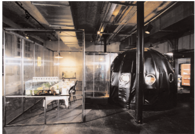
Figure 1. The Tissue Culture & Art Project, Disembodied Cuisine installation, Nantes, France, 2003.

As part of the TC&A project, we explore the ironies involved in the promise of a Victimless Utopia. In our Victimless Utopia series, we have explored the creation / construction of victimless meat in a project titled Disembodied Cuisine . [17] We ate, together with some brave volunteers, tiny semi-living frog steaks that were grown for more than two months in bioreactors and used not only expensive resources but also animal-derived ingredients in the nutrient media. [Fig. 1] We referred to them ironically as extreme Nouvelle Cuisine in the sense that they were luxury goods (and not necessarily tasteful ones). Still, the irony sometimes seems to be lost too easily, and now the discourse about a victimless society is being used by a university spin-off company that attempts to secure funding for tissue-engineered meat as a possibility for eating meat without killing the animal. [18]