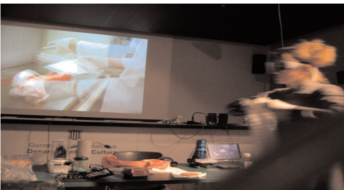
Figure 3. The Tissue Culture & Art Project, The DIY De-victimizer (2006). Performance.